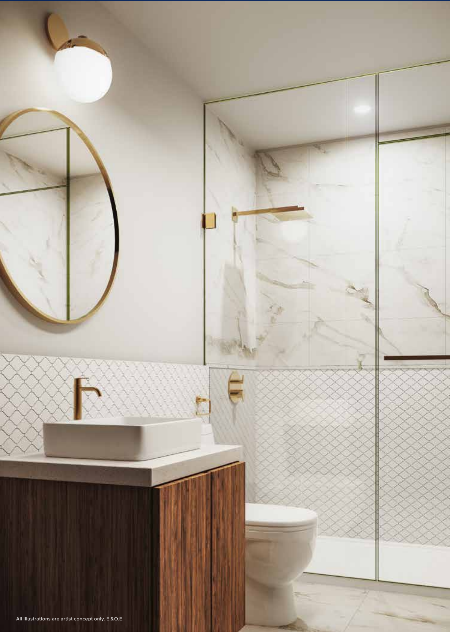
All illustrations are artist concept only. E.&O.E.

Distrik Trailside West is part of a master-planned community. The West phase includes a ten storey building with two blocks of single and two storey executive suites designed by Kirkor Architects.